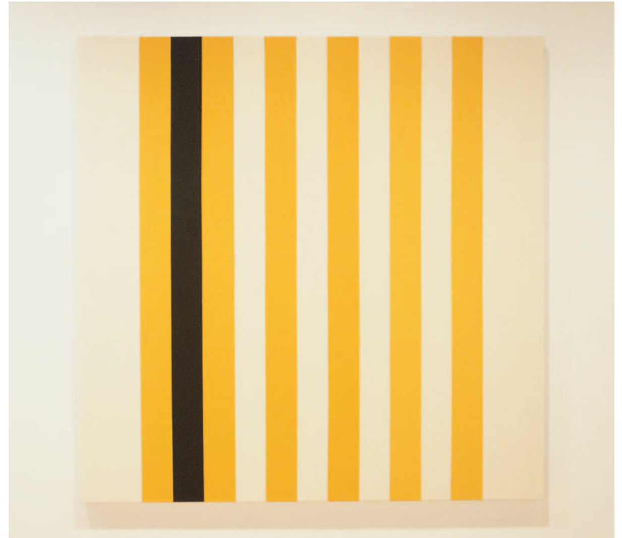
threeway from the yellowyellow series 2000