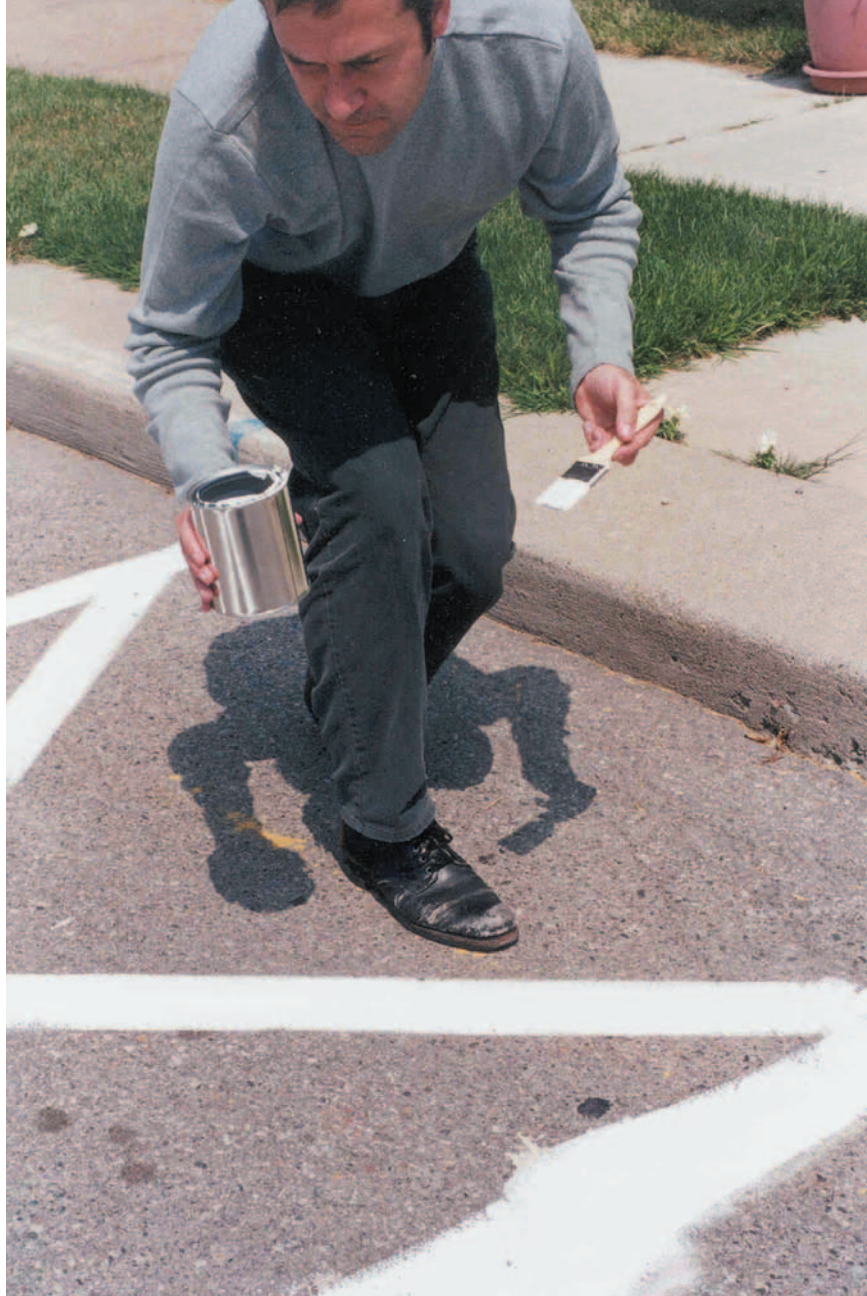
the hand loves that which is hard: Trenton 2001