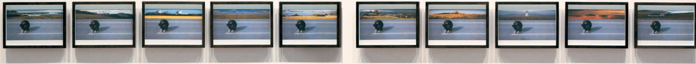
the hand loves that which is hard: the #1, virtual 2000–2002