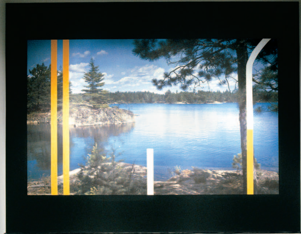
parcel the journey with the destination 2001–2002