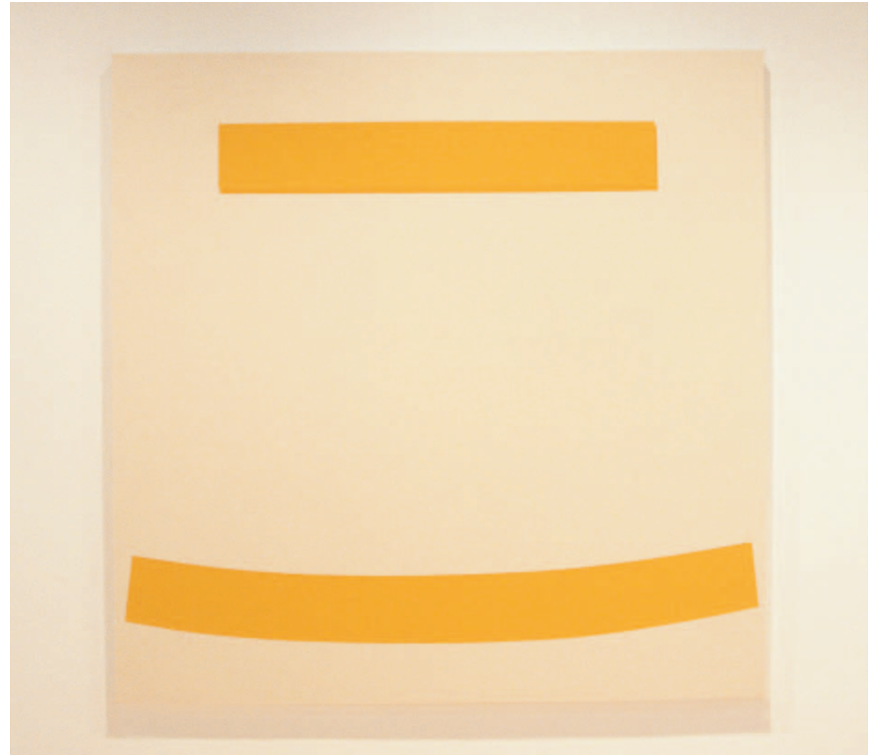
Painting Ends from the yellowyellow series 2000-2001