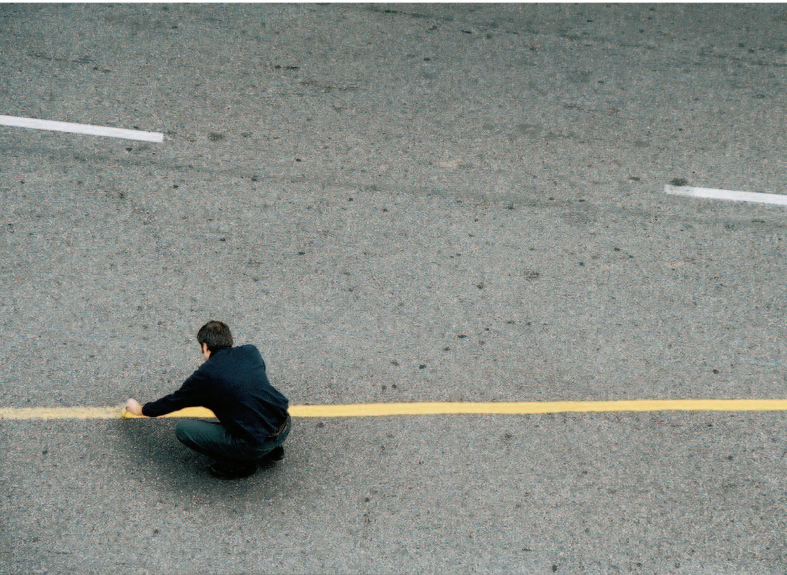
the hand loves that which is hard: Kitchener 2001